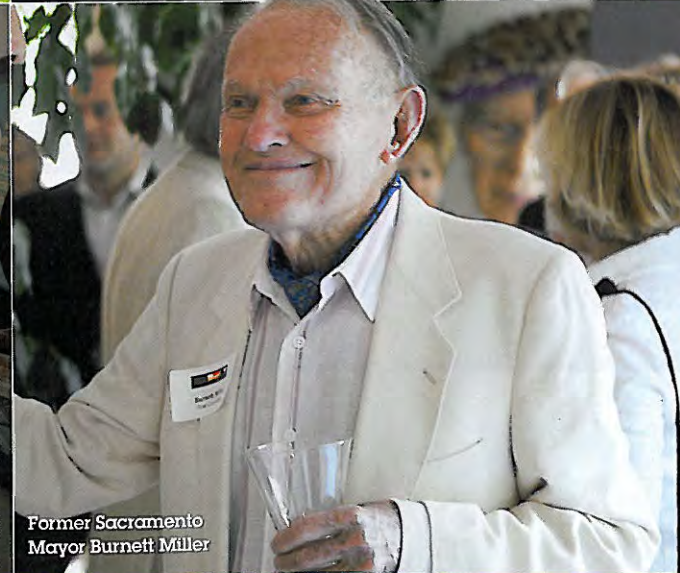
Former Sacramento Mayor Burnett Miller